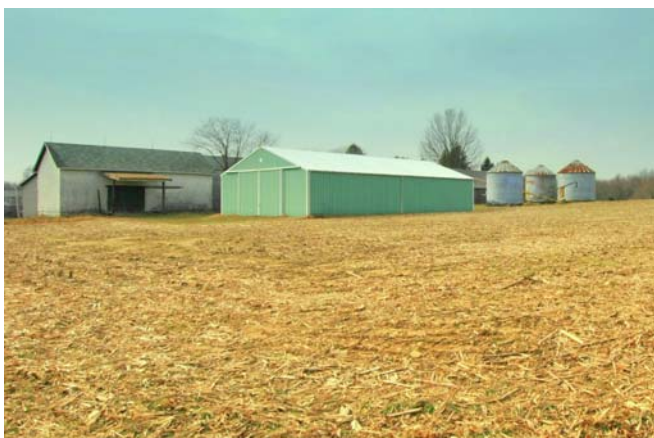
The Appelget Farm