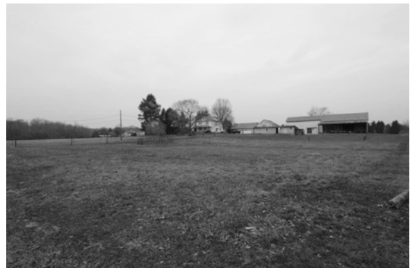
The Appelget Farm

Don't forget to renew your membership every year!